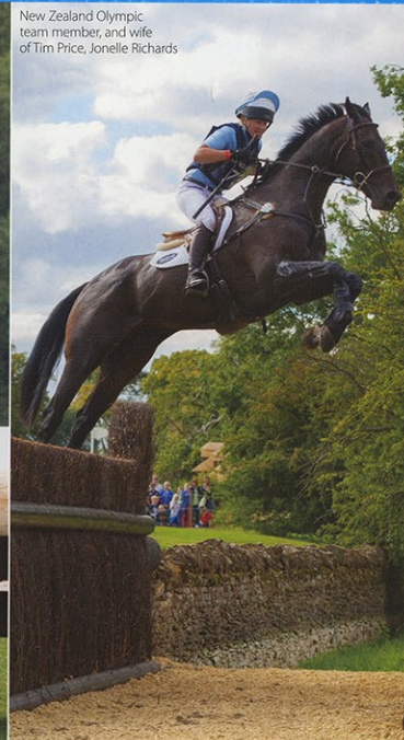
New Zealand Olympic team member, and wife of Tim Price, Jonelle Richards